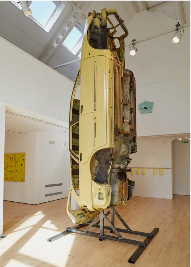
Installation view of You Say Volvo, I Say Potato, Stanley Picker Gallery, Kingston University, London, 2018.