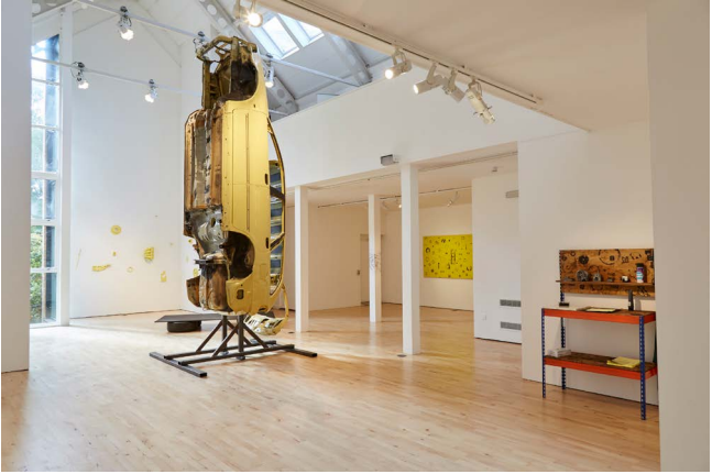
Installation view of You Say Volvo, I Say Potato, Stanley Picker Gallery, Kingston University, London, 2018.