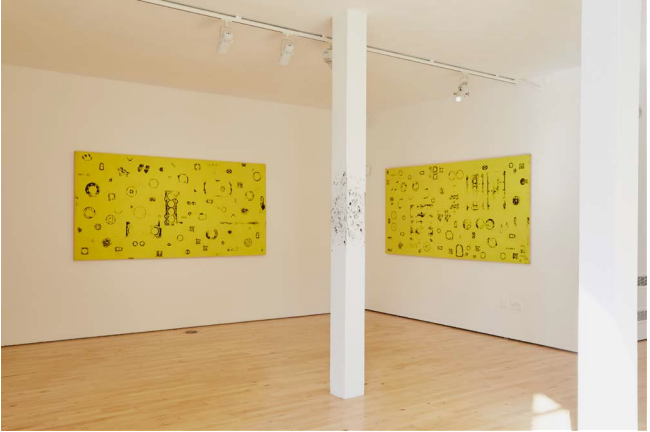
Installation view of You Say Volvo, I Say Potato, Stanley Picker Gallery, Kingston University, London, 2018.