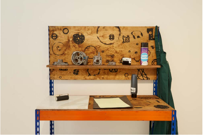
I Say Potato Printing Station at You Say Volvo, I Say Potato, Stanley Picker Gallery, Kingston University, London, 2018.