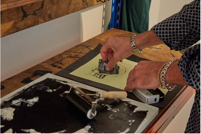
I Say Potato Printing Station at You Say Volvo, I Say Potato, Stanley Picker Gallery, Kingston University, London, 2019.