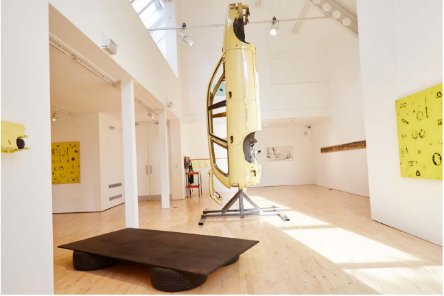
Installation view of You Say Volvo, I Say Potato, Stanley Picker Gallery, Kingston University, London, 2018.