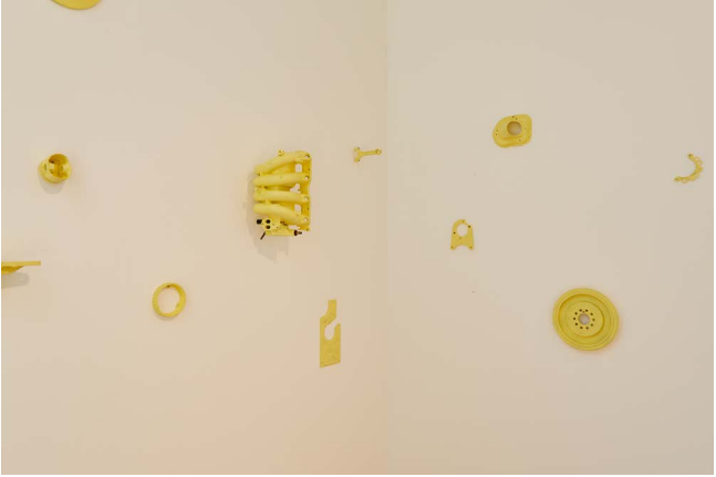
Installation view of You Say Volvo, I Say Potato, Stanley Picker Gallery, Kingston University, London, 2018.