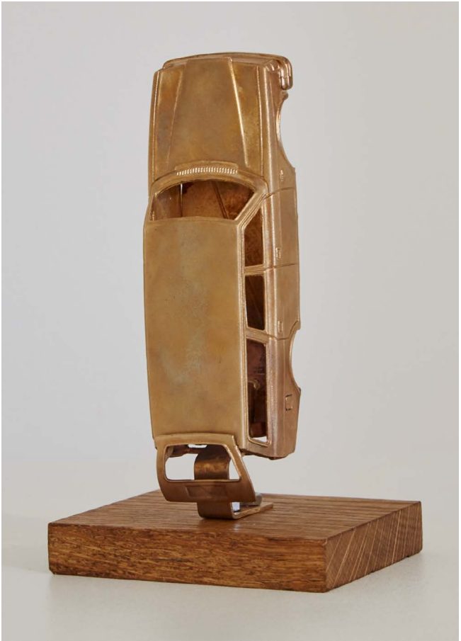
Lost Wax / Die Cast Volvo Estate for You Say Volvo, I Say Potato, Stanley Picker Gallery, Kingston University, London, 2018.