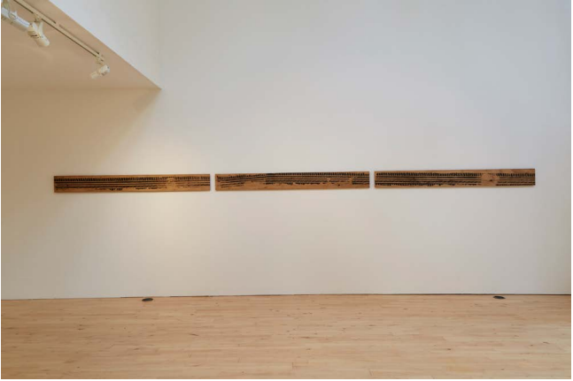
Car Tyre Print (Homage to Robert Rauschenberg) at You Say Volvo, I Say Potato, Stanley Picker Gallery, Kingston University, London, 2018.